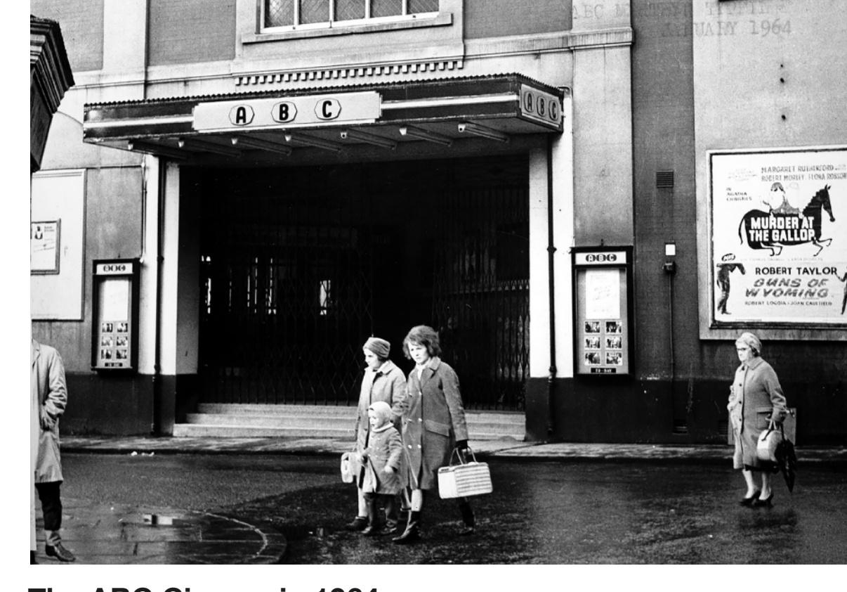
The ABC Cinema in 1964.