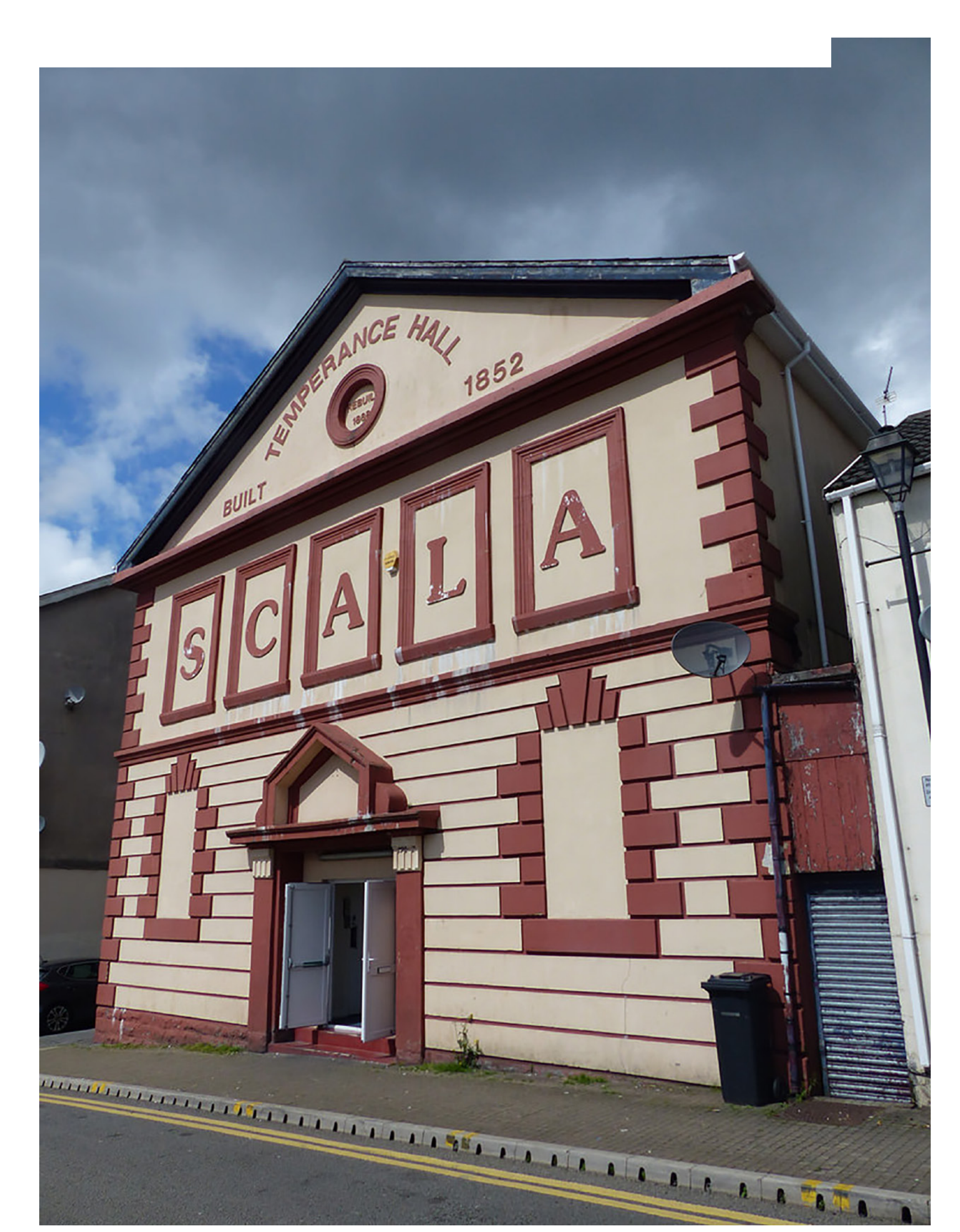
The Temperance Hall.