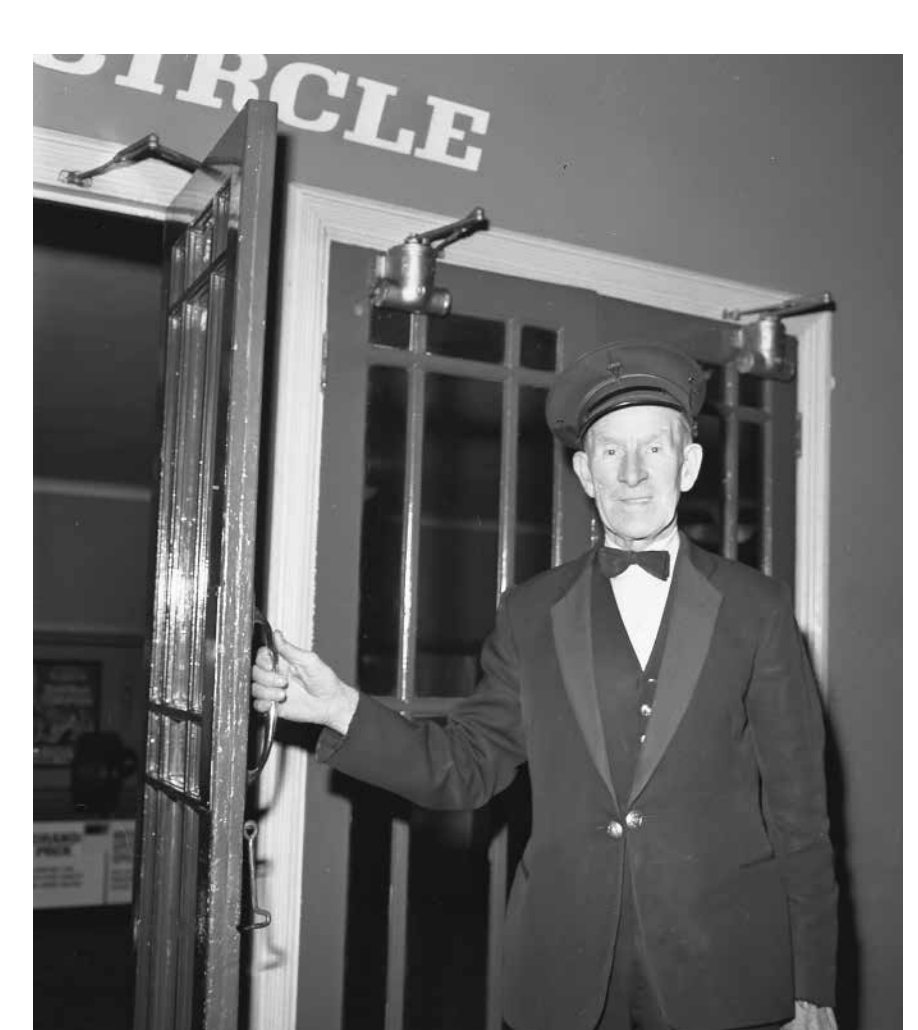
Castle Cinema Doorman.

The Castle Cinema, Pontmorlais, opened on June 29th 1912 with seats for 897 persons. By the end of the 1950s the Castle ceased to be a cinema but continued as the Palace Dance Hall. The building was demolished as part of a redevelopment program in the 1980s and the site is now a car park.