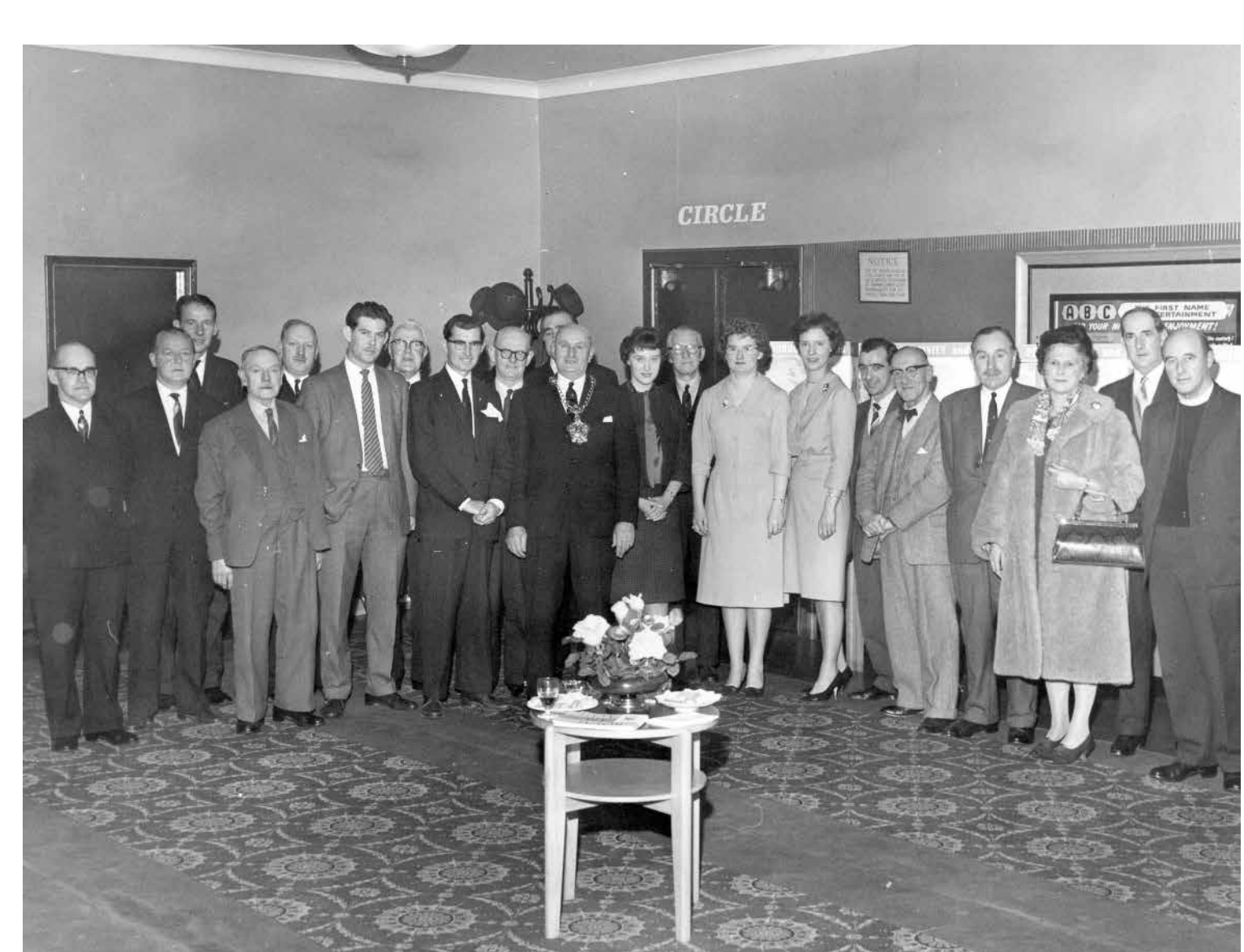
The Castle Cinema Changes to the ABC.